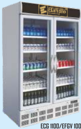
ECG 1100/EFVG 1000