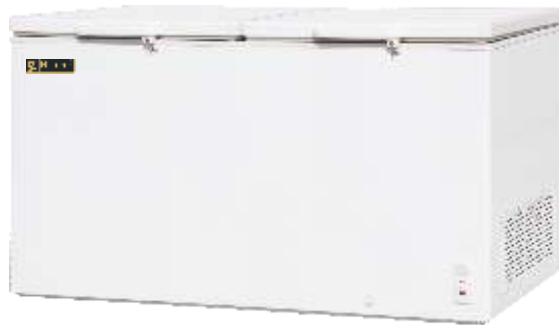
EF 455/EF 555