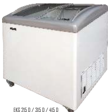
EKG 215 D / 315 D / 415 D