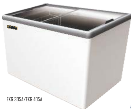
EKG 305A/EKG 405A