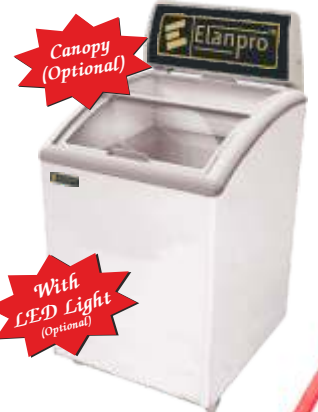
EKG 155 D