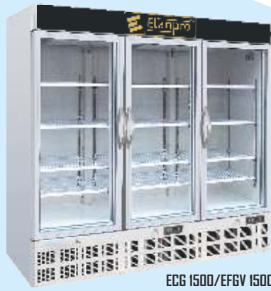
ECG 1500/EFVG 1500