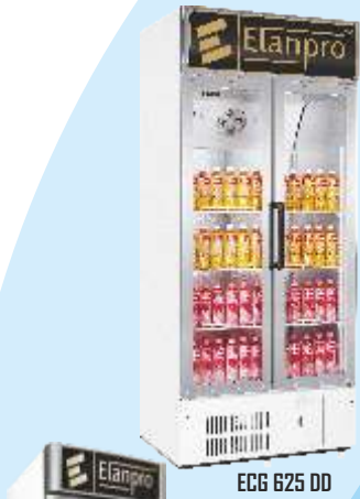
ECG 625 DD